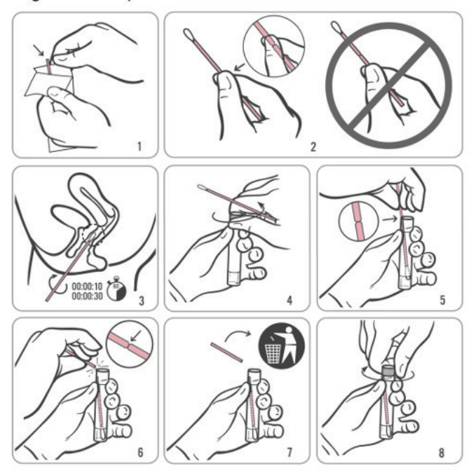
Vaginal Swab Specimen Collection